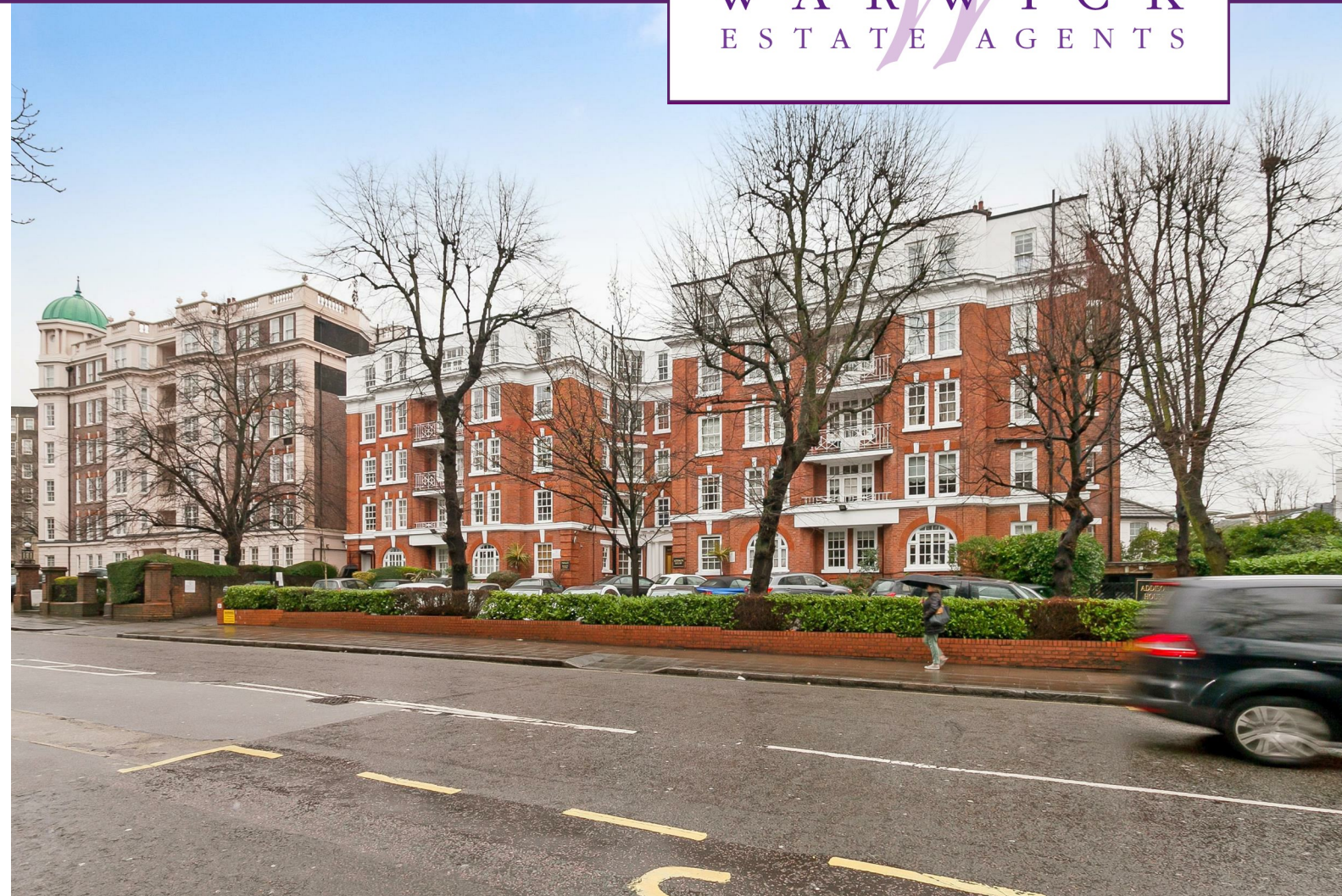
Grove End Road, London, NW8 9EL

Offers In Excess Of £320,000 Subject to Contract